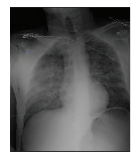
Figure 1: Chest radiograph demonstrating diffuse bilateral infiltrative areas with acute respiratory distress syndrome on the 1<sup>st</sup> day

ARDS is an acute, diffuse injury of the lung due to inflammatory processes. In this severe lung condition, the intra-alveolar protein-rich liquid cannot be discharged and deposited due to the increase in capillary