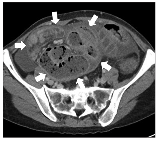
Figure 2: Axial computed tomography shows that the small intestinal loops are encased by the thick and sac-like membrane (white arrow). Dilatation of the small intestine and thickening of the intestinal wall are observed inside the sac

SEP is characterized by partial or complete enclosing of the small intestines by a thick fibro-collagenous membrane, which gives the appearance of a cocoon within the peritoneal cavity. Because of this feature, it is also known as "abdominal cocoon" and "encapsulating peritoneal sclerosis." SEP is classified as primary or secondary depending on the underlying cause. Primary SEP is idiopathic, and the etiology remains unclear. The primary SEP was reported to occur more commonly in tropical and subtropical countries. On the other hand,