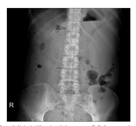
Figure 1: Abdominal X-ray (erect) shows no specific findings suggestive of intestinal obstruction

At the time of arrival in the ED, her blood pressure was 128/51 mmHg, body temperature was 36.6°C, pulse rate was 90 beats/min, and respiratory rate was 20 breaths/min. Physical examination revealed tenderness and rebound tenderness on the right lower quadrant (RLQ) with heightened intestinal sounds. Laboratory tests showed as follows: leukocyte count: 2,300/\mu L (reference, 4,000-10,000/\mu L), platelet count: 63,000/μL (reference, 150,000–450,000/μL), C-reactive protein level: 3.93 mg/dL (reference, <0.3 mg/dL), albumin level: 3.1 g/dL (reference, 3.8–5.3 g/dL), total bilirubin level: 1.6 mg/dL (reference, 0.2–1.2 mg/dL), and prothrombin time International normalized ratio (INR): 1.52 INR (reference, 0.88–1.20 INR). Moreover, the results of other laboratory tests were within the normal limits. Abdominal X-ray did not show any specific findings suggestive of intestinal obstruction [Figure 1]. Because the patient had persistent peritoneal irritation signs, an abdominal CT was conducted to differentiate the cause of abdominal pain. Abdominal CT showed dilated small