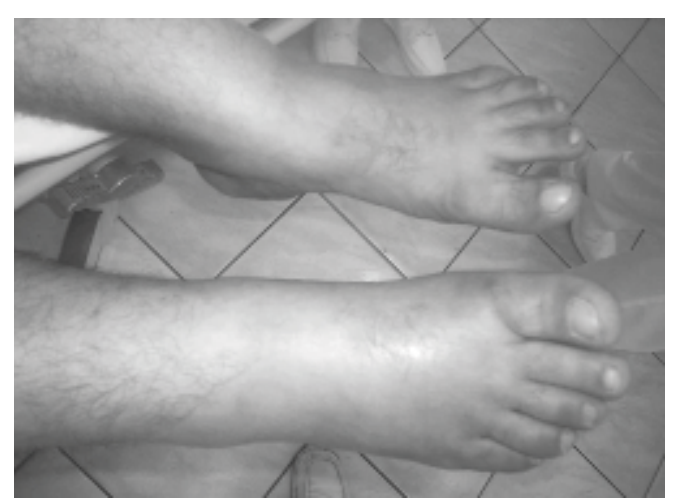
Fig. 1. Edema on right foot and ankle.

In the beginning of spring and summer, they migrate to shores to spawn. They spend most of their lifetime buried in